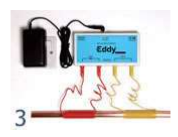
Step 3 - Plug in the power unit provided to a nearby electricity supply. Switch on at the supply and check that all the lights on the Eddy unit are illuminated. That's it . . . . . Easy!

Fit an Eddy water descaler to combat the nuisance of hard water and limescale in the home.