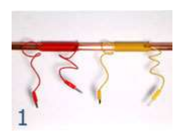
Step 1 - Wind two coils of wire (supplied) onto your incoming cold water supply pipe. It does not matter if the pipe is horizontal or vertical, or which way the water flows through the coils.